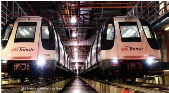
SBS Transit's North East Line Trains