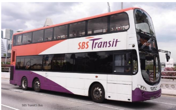
SBS Transit's Bus