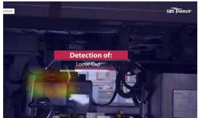
AVATAR, an autonomous, AI-enabled robotic dog that assists with saloon inspections and underframe checks.

SBS Transit is driving operational efficiency through the integration of Artificial Intelligence (AI). For train maintenance, the AI-enabled robotic dog (AVATAR) automates saloon and underframe inspections, resulting in faster, more accurate, and reliable processes.