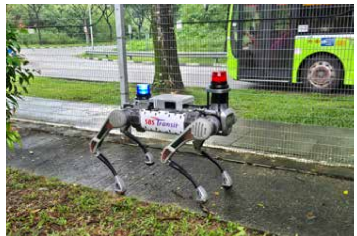
Meet MARS, the first-of-its-kind AI-enabled robotic dog currently being trialled at Seletar Bus Depot for intrusion detection.

Lastly, we introduced MARS (Mobile Autonomous Robotic Surveillance) at Seletar Bus Depot, an AI-enabled robotic dog equipped with advanced vision capabilities to navigate stairs and complex terrains while patrolling the depot for signs of intrusion and ensuring its security. To ensure safer commutes, SENTINEL, a smart security system, consolidates data from mobile CCTVs and security robots at our transport hub into a unified platform, providing security officers with real-time alerts and enabling rapid incident response.